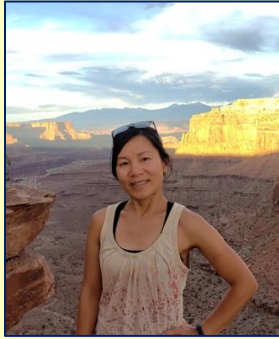
ANH: Awana & VBS