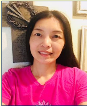
CHIN-AN Welcome & Outreach Ministry