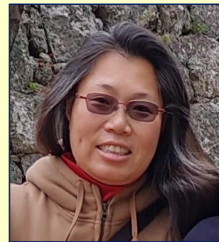
ALICE: Media Resource